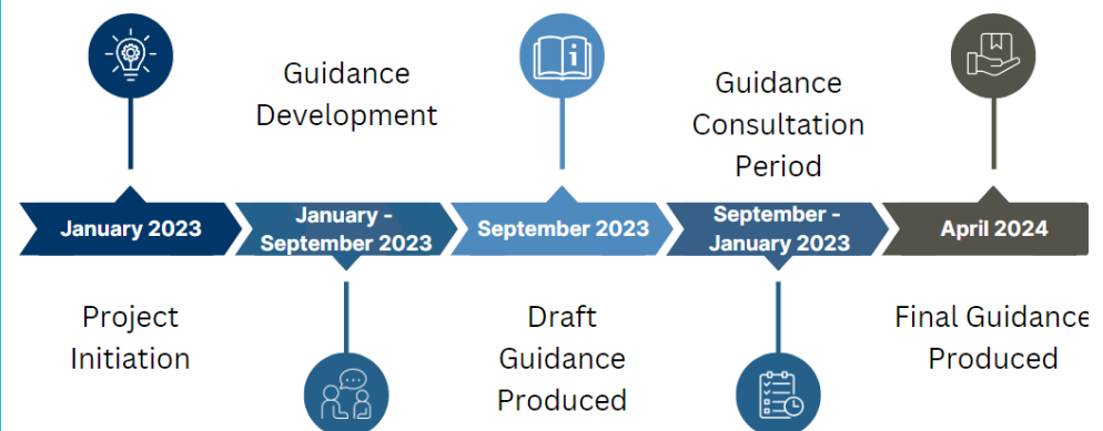
Figure 1: Timeline of key milestones linked to the guidance.

The following timeline shows some of the key milestones in the development of the guidance.