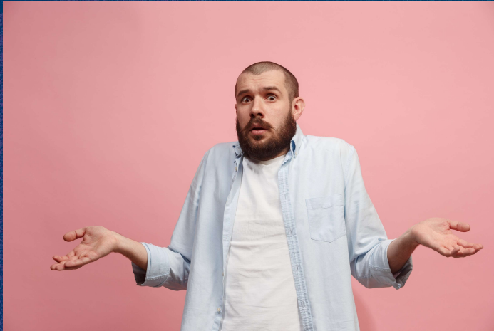
Man holding hands out looking confused